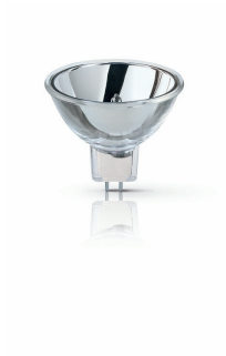
XPPR XHOPDI 0002