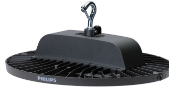
GreenPerform Highbay G3 BY698P Fixed Side