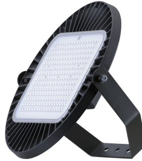
GreenPerform Highbay G3 BY698P with Bracket