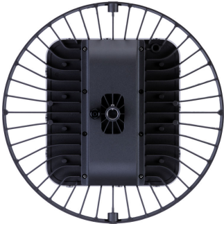
GreenPerform Highbay G3 BY698P Fixed Back