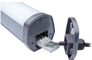
WT188C Terminal Block Pushin Detail Photo