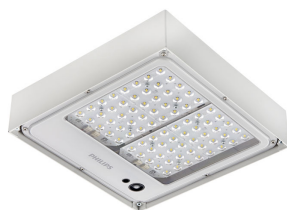
Mini 300 LED gen3