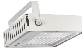
Mini300_gen3- BBP333_RM_with_accessory_kit- DPP.TIF