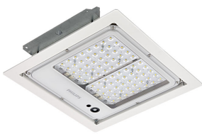
Mini 300 LED gen3