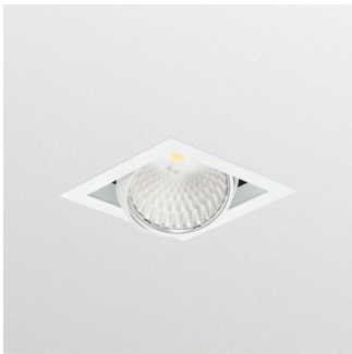
GreenSpace Accent Gridlight-RS301B WH