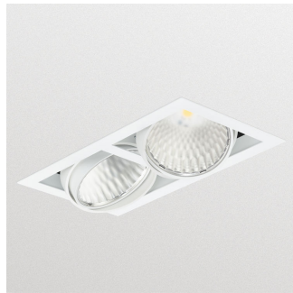
GreenSpace Accent Gridlight-RS302B WH