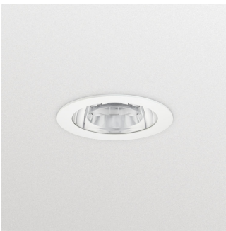
Greenspace EU gen 2-DN463B