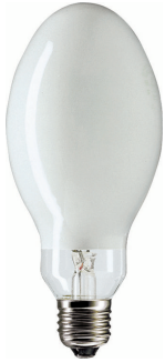
LPPR SON-PIA 0002