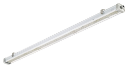
Pacific LED gen5, L1800