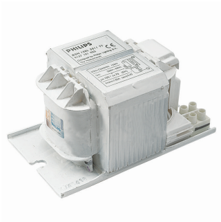
BHL 250L 200