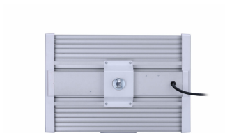
GreenUp Highbay G2 BY560P LED160 B