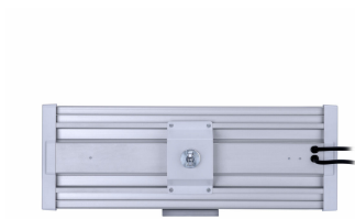
GreenUp Highbay G2 BY560P LED105 B