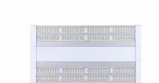
GreenUp Highbay G2 BY560P LED210 F