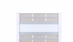
GreenUp Highbay G2 BY560P LED160 F