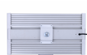
GreenUp Highbay G2 BY560P LED210 B