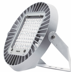
GreenPerform Highbay HT