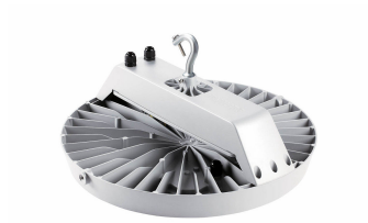
GreenPerform Highbay HT