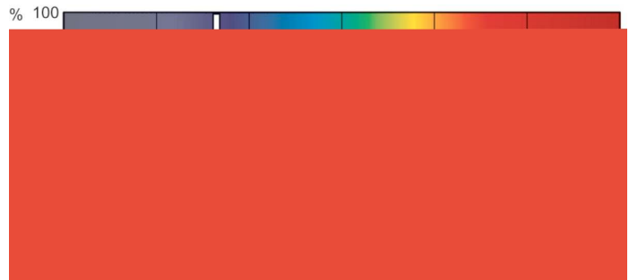
XDPB_XDMSR_SA-Spectral power distribution B/W